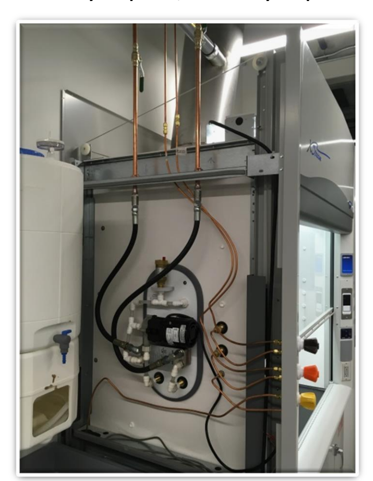
Back Side of EcoDenser